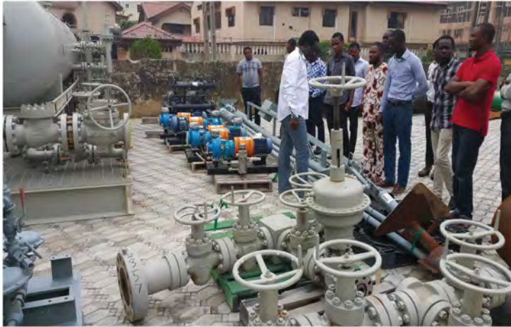
Participants Introduced to various surface production Vessels/Equipment