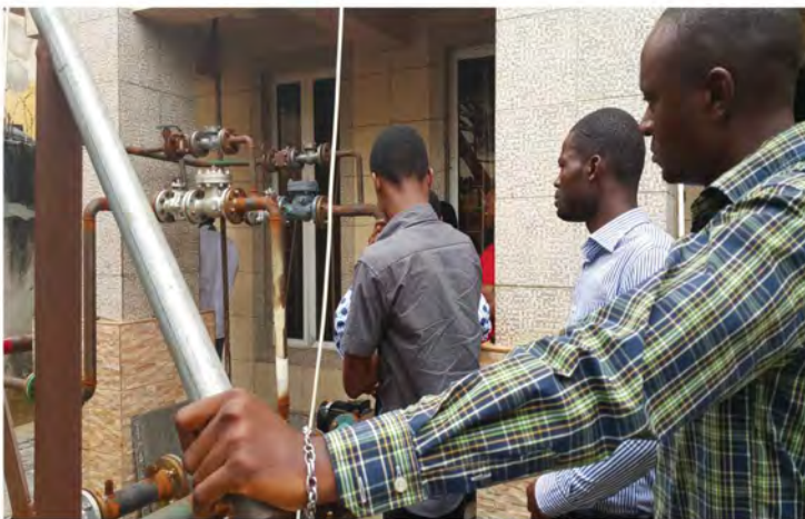
Participants at the FEDP Pilot Plant Training Facility