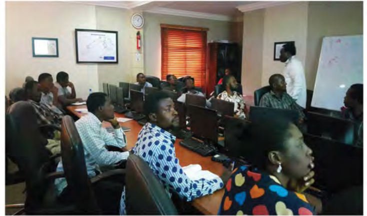
Participants listening with keen interest during the lecture session