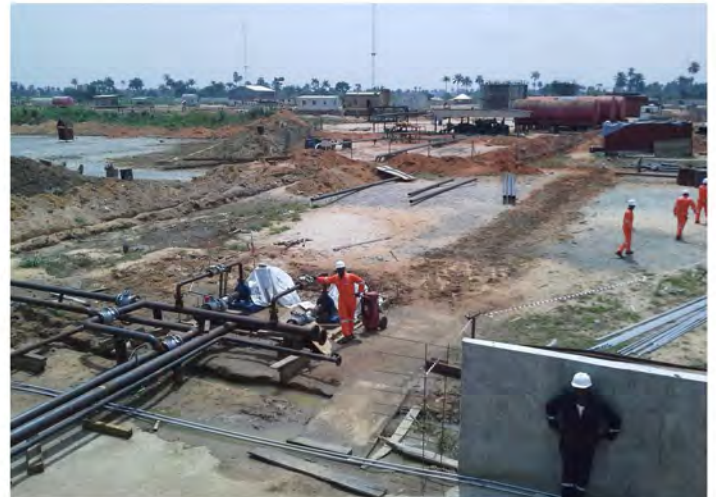
Participants at 10,000 Barrels Crude Oil Storage Tank Area, Energia/Oando JV Production Flowstation in Kwale, Delta State. Construction Activities in Progress